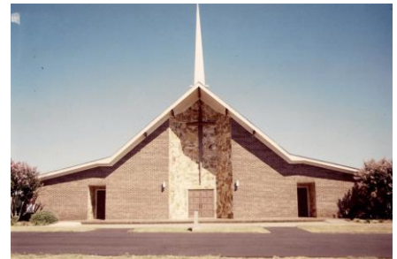
Completed Church, April 1981