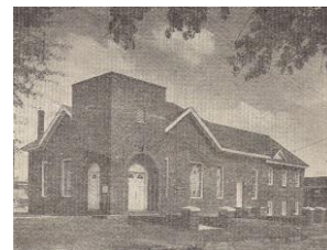
Remodeled Church, 1956