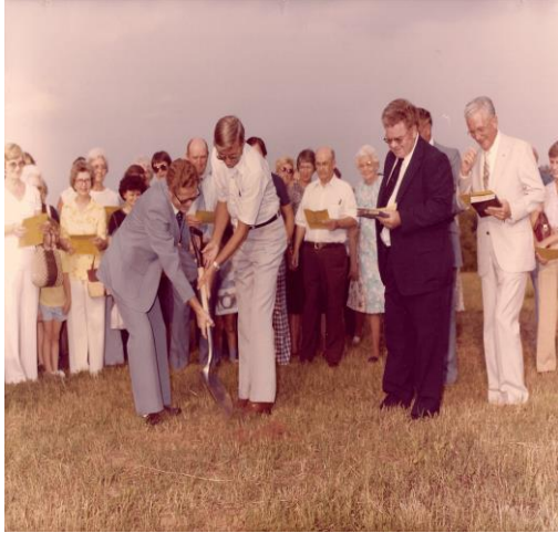
Ground Breaking Service for New Church, August 1980