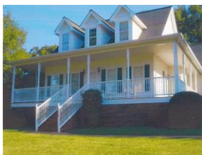
Parsonage Purchased, 2003

Thirty-seven hand bells were purchased through donations in memory of or in honor of special persons or events. The Hand Bells were dedicated on May 5, 2002, with a special program and performance.