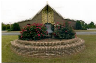
Pastoral Bell Garden