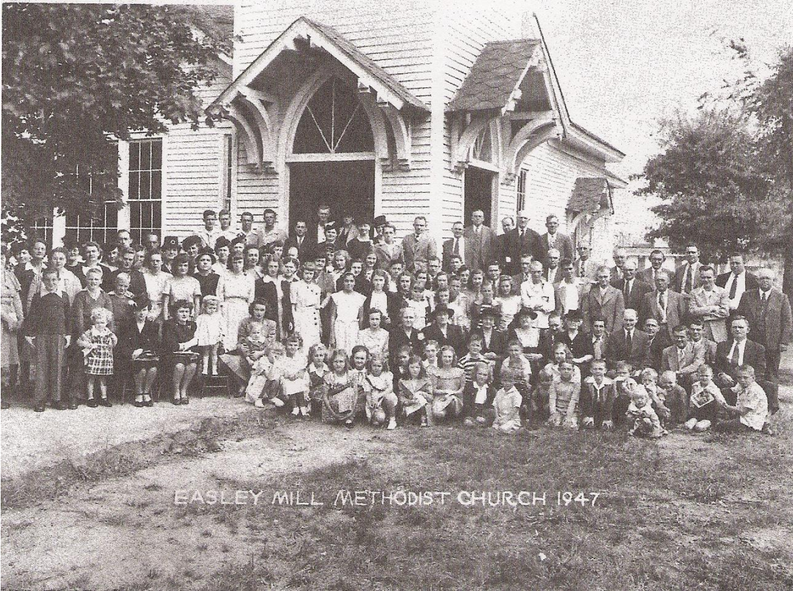
EASLEY MILL METHODIST CHURCH 1947